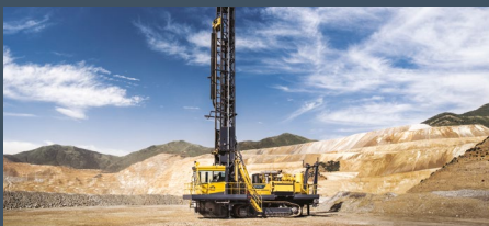
Compressor LP-150 - Lubricating mineral oil in rotary air compressors.

Protects against corrosion and facilitates drainage of any condensate moisture